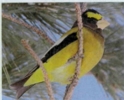
Researchers confirmed the decline of the evening grosbeak population, once one of the most common feeder birds, after analyzing data submitted by Project FeederWatch observers.

Gram says another goal is to develop NEON's citizen science projects in such a way that scientists anticipate the data and are ready to use them when they're available. "Everyone, including NSF [National Science Foundation] and research scientists and educators and this whole broader community, recognizes that it's great to collect all this data, but if the data themselves aren't usable and accessible and actually being valued by a variety of communities...that is going to be a disservice to all of the effort and funds that are being put into it."