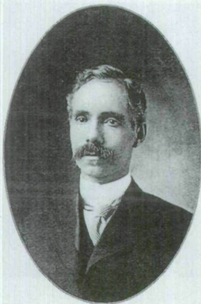
Government biologist Wells Cooke launched a program to document bird migration habits that eventually swelled to 3000 volunteers across North America. The program ran from 1890 to 1970, and now efforts are under way to transcribe all of the handwritten records.

transcription software a requirement for each card to be entered twice, by different transcribers, so inconsistencies can be weeded out. If the two entries don't match, the card is sent back into the pool to be transcribed again. Zelt says efforts are under way to collect similar data through contemporary observations, thereby strengthening the value of the historical information.